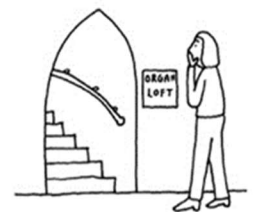
TRAVELLING TO NEW PLACES